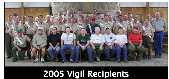
2005 Vigil Recipients

The LLDC theme this year is going to be a "Military Service" theme so wear your military and or camo stuff and plan on a good day of fun and learning on December 10th. Lodge officers are requested to be "in costume" for sure!