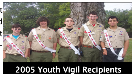
2005 Youth Vigil Recipients